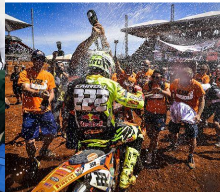
Antonio Cairoli, MX Champion