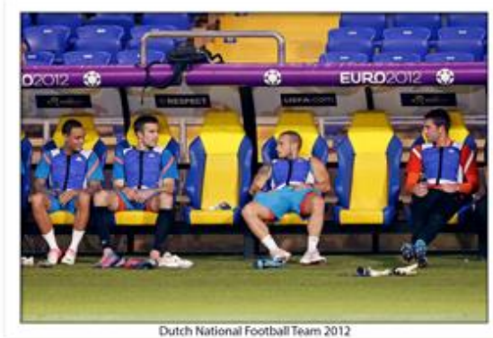
Dutch National Football Team 2012