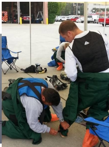
FEMA Crew Los Angeles Team