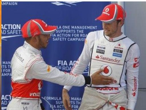
Lewis Hamilton, Jenson Button F1 Champions

Some of the best athletes in the world, and some of the most important First Responders on the planet!!!